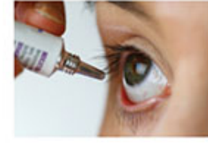
Figure A3. Administering eye ointment or gels

When using an eye ointment or gel for the first time, write the date the tube is opened on the tube as a reminder to discard the contents after 28 days (or according to the manufacturer's specifications).